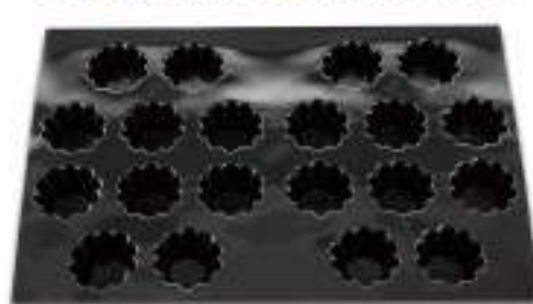
EVD018 Large Fluted Brioche

Dimensions 400 x 300 mm (Half) / 600 x 400 mm (Full) Cavity: 10 / 20 Cavity Dimension: Ø81 x 37 mm (Vol 130ml)