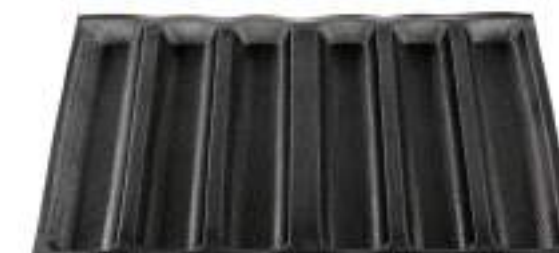
EVU015 15 inch air bread form

Dimensions 330 x 420 mm (Half) / 660 x 420 mm (Full) Cavity: 3 / 6