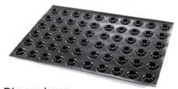
EVD006 Mini-Round Savarins

Dimensions 400 x 300 mm (Half) / 600 x 400 mm (Full) Cavity: 30 / 60