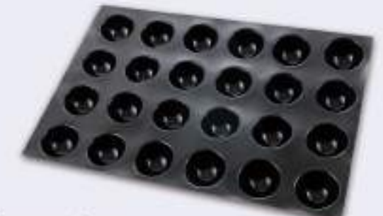
EVD004 Half Spheres

Dimensions 400 x 300 mm (Half) / 600 x 400 mm (Full) Cavity: 12 / 24