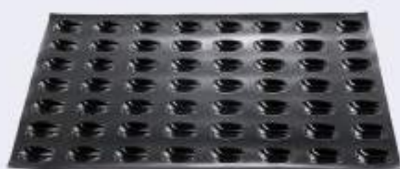
EVD009 Mini Madeleines

Dimensions 400 x 300 mm (Half) / 600 x 400 mm (Full) Cavity: 28 / 56