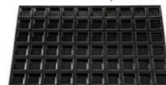
EVD014 Mini-Low square

Dimensions 400 x 300 mm (Half) / 600 x 400 mm (Full) Cavity: 30 / 60