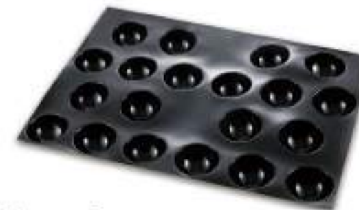
EVD003 Large Half Spheres

Dimensions 400 x 300 mm (Half) / 600 x 400 mm (Full) Cavity: 10 / 20