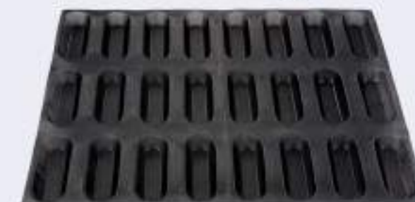
EVU007 6.6 inches Hot Dog Bread

Dimensions 600 x 400 mm (Half) / 600 x 800 mm (Full) Cavity: 12 / 24