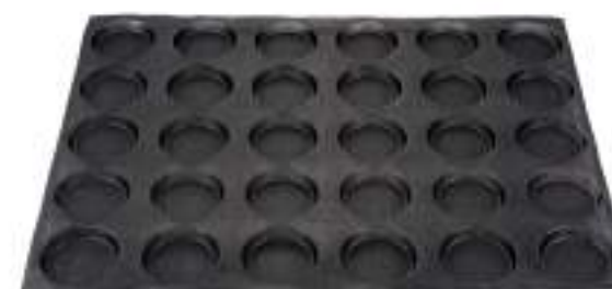
EVU006 4 inches hamburger

Dimensions 600 x 400 mm (Half) / 600 x 800 mm (Full) Cavity: 15 / 30