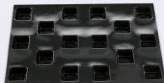
EVD016 Square Boxes

Dimensions 400 x 300 mm (Half) / 600 x 400 mm (Full) Cavity: 8 / 16 Cavity Dimension: 65 x 65 x 35 mm (Vol 140ml)