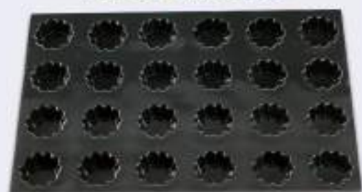
EVD017 Fluted Brioche

Dimensions 400 x 300 mm (Half) / 600 x 400 mm (Full) Cavity: 12 / 24 Cavity Dimension: Ø68 x 25 mm (Vol 60ml)