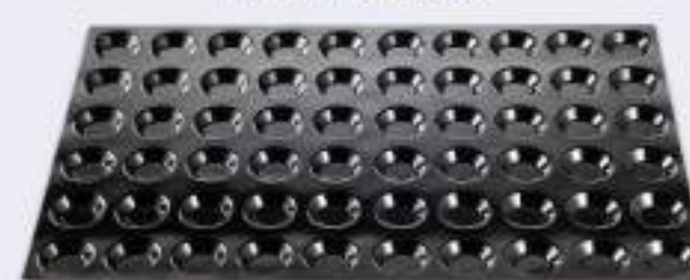
EVD023 Mini Tartlets

Dimensions 400 x 300 mm (Half) / 600 x 400 mm (Full) Cavity: 30 / 60 Cavity Dimension: Ø42 x 10mm (Vol 15ml)