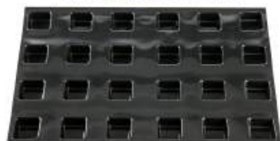
EVD015 Mini Square Boxes

Dimensions 400 x 300 mm (Half) / 600 x 400 mm (Full) Cavity: 12 / 24 Cavity Dimension: 50 x 50 x 29 mm (Vol 80ml)