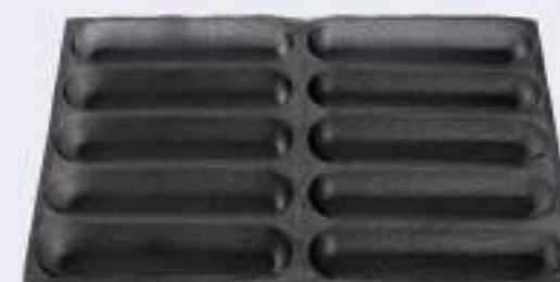
EVU013 12 inch air bread form

Dimensions 332 x 445 mm (Half) / 665 x 445 mm (Full) Cavity: 5 / 10