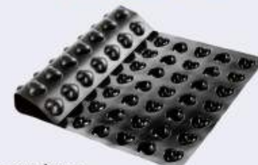
EVD012 Mini-Round Heart

Dimensions 400 x 300 mm (Half) / 600 x 400 mm (Full) Cavity: 35 / 70