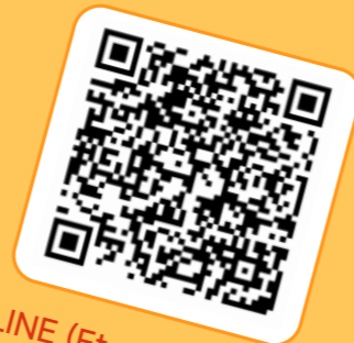
LINE (Eternal Select)