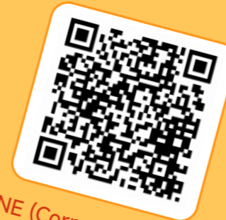
LINE (Corporate Orders)