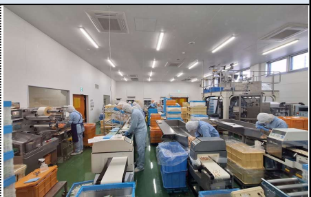
Packaging room, Various packaging machines