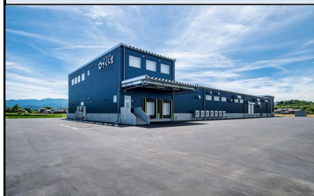
New factory built in 2024 [FSSC22000]