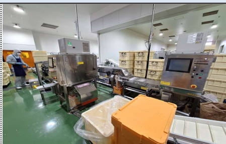
Two state-of-the-art sorting machines