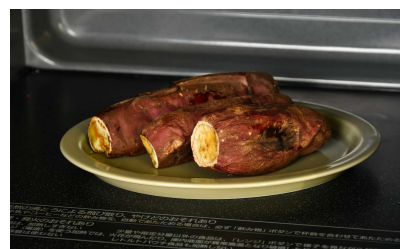
After thawing naturally, you can warm it up in the microwave.