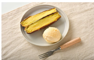
Thaw naturally and enjoy as a cold dessert