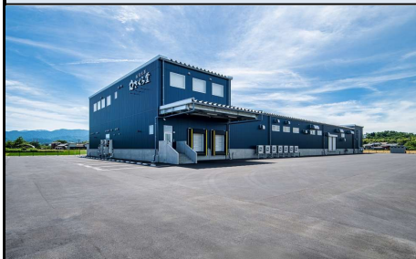
New factory built in 2024 [FSSC22000]