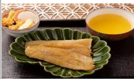
snack served with tea