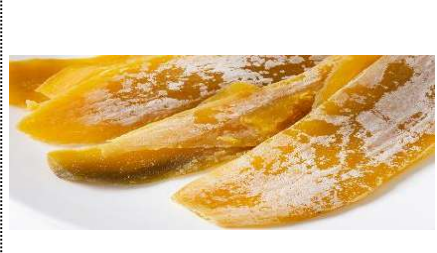
The white powder that forms on the surface is the crystallization of maltose