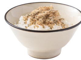
Japanese Furikake on Rice