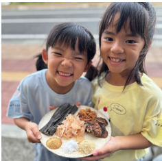
Children enjoying authentic Japanese flavor