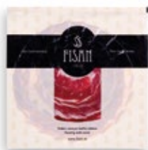
Hand carved vacuum packed