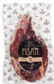
Boneless piece vacuum packed