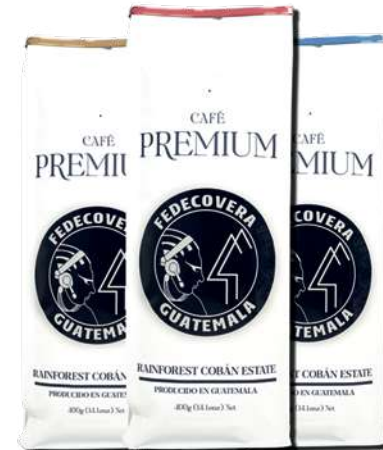
Our brand presentation

Ground Roasted Coffee: From 30 kg up to 69 Kg bags.