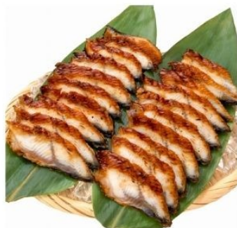
Sushi Ingredient Slices