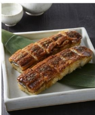
Eel Stick Sushi

Our company specializes in manual frozen food operations. We produce topping pizza, breading work for shrimp and oysters, slicing work for sushi items, and kit for sushi rolls. We also manufacture products under the supervision of famous Japanese restaurants and others.