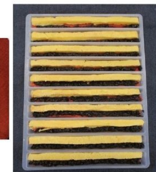
Frozen Roll sushi kit