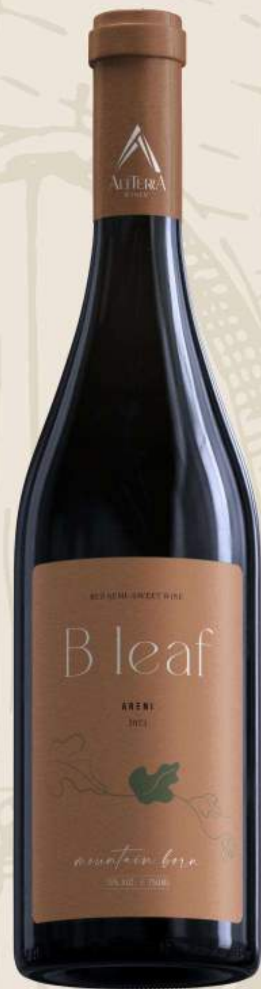
B LEAF ARENI SEMI-SWEET