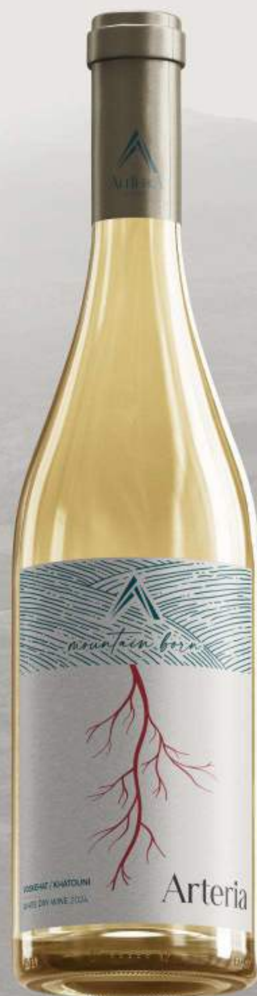
ARTERIA VOSKEHAT/ KHATOUNI