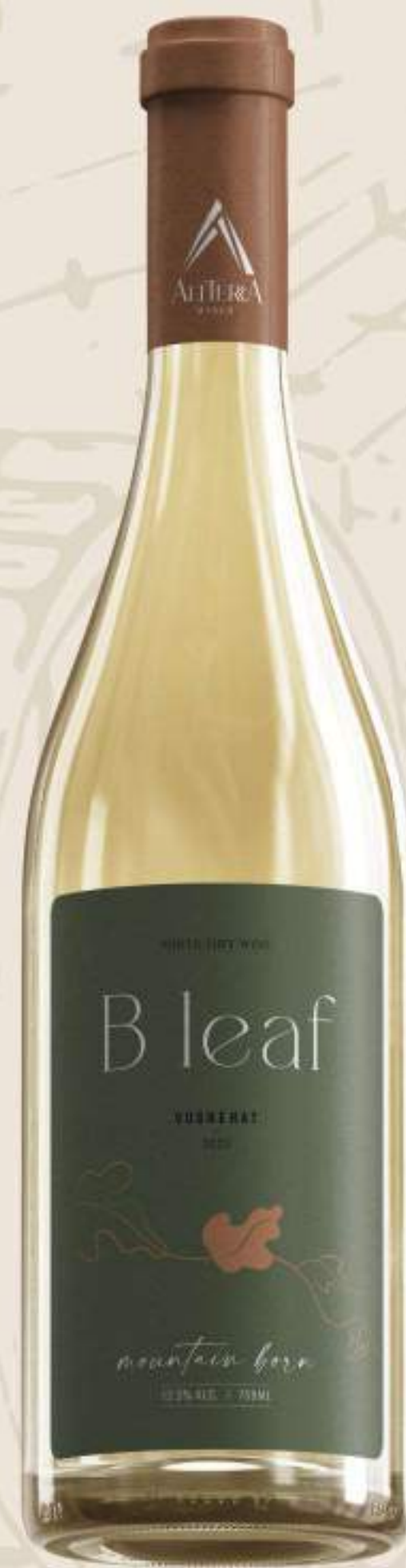
B LEAF VOSKEHAT