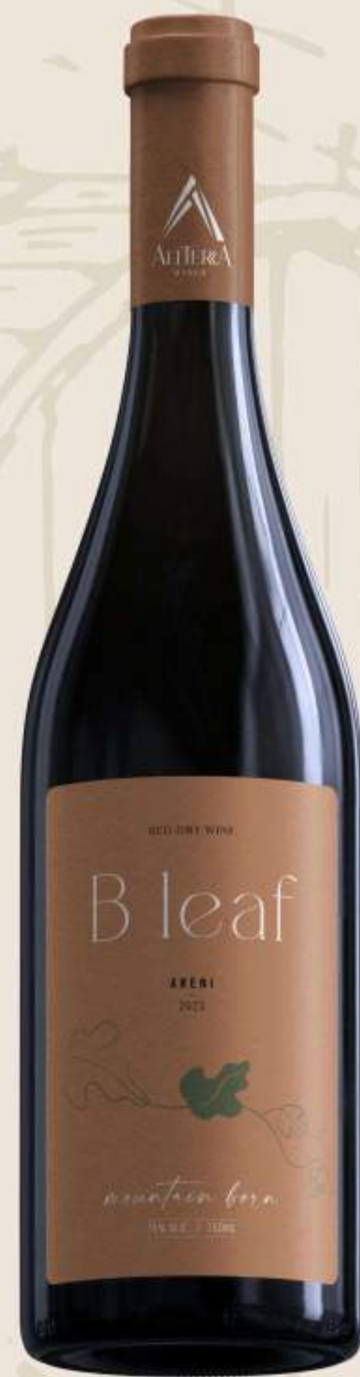
B LEAF ARENI