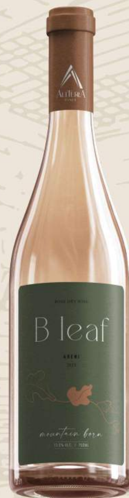
B LEAF ARENI