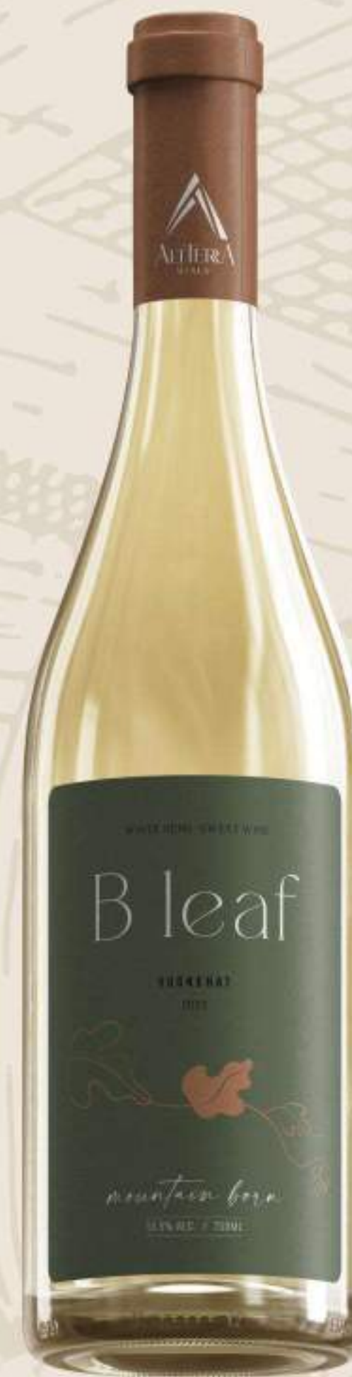
B LEAF VOSKEHAT SEMI-SWEET