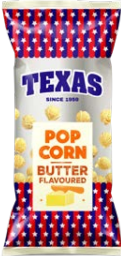
Butter flavoured 60g