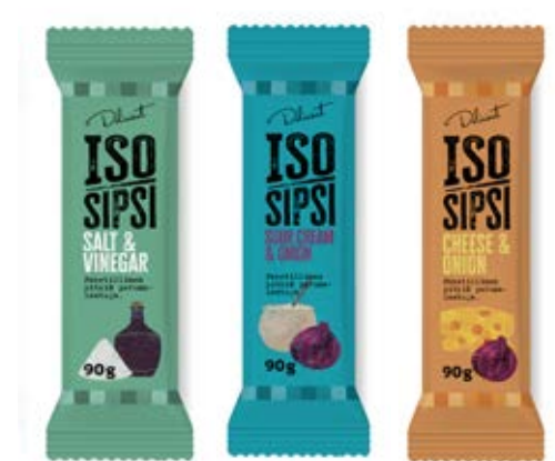
ISO SIPSI/ private label in Finland