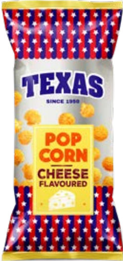
Cheese flavoured 60g