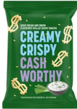
Sour cream & onion flavoured 50g