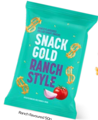
Ranch flavoured 50g