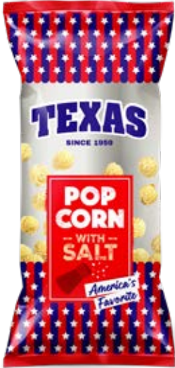
Salt flavoured 60g