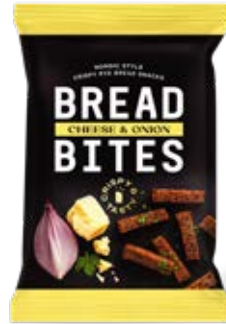
Cheese and onion flavoured 80g