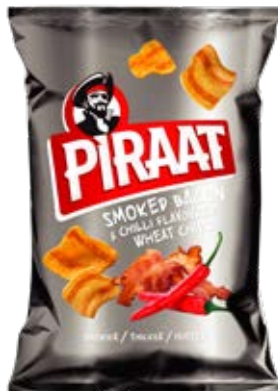
Bacon and chilli flavoured 150g