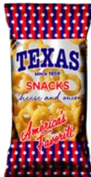
Cheese and onion flavoured 60g