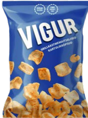
BBQ flavoured 70g