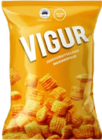
Cheese flavoured 90g