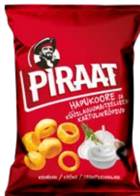
Sour cream and garlic flavoured 220g, 150g, 60g