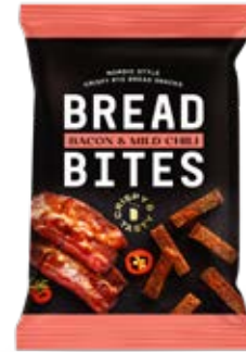
Bacon and mild chilli flavoured 80g