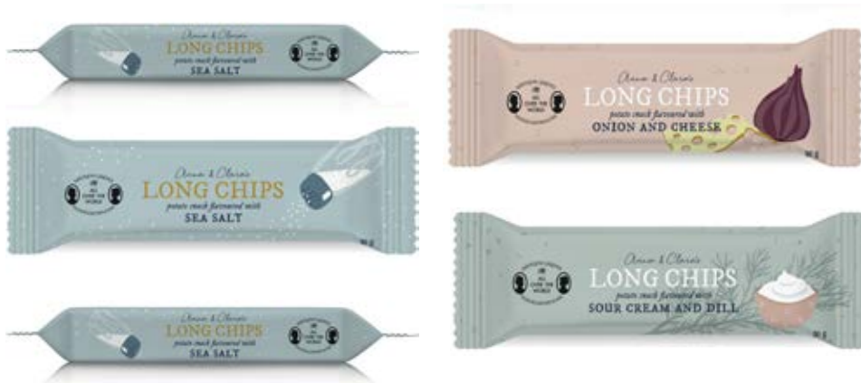
Anna & Clara`s/ private label in Denmark