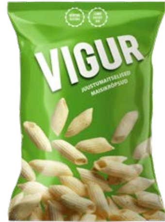
Cheese and onion flavoured 90g