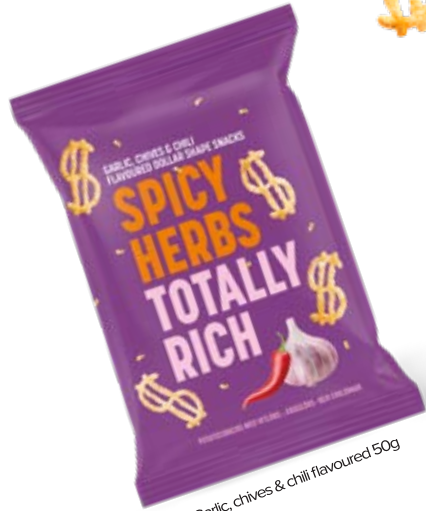
Garlic, chives & chili flavoured 50g