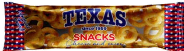
Cheese and onion flavoured 150g