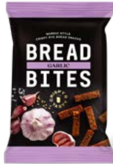
Garlic flavoured 80g