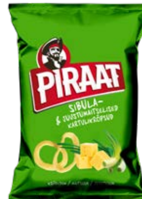
Onion and cheese flavoured 150g