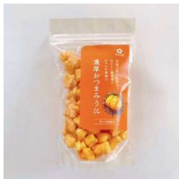
Crispy and Puffy