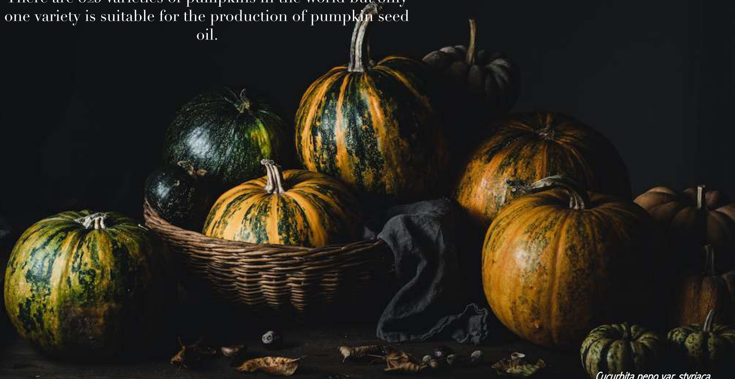
Cucurbita pepo var. styriaca.

There are 825 varieties of pumpkins in the world but only one variety is suitable for the production of pumpkin seed oil.