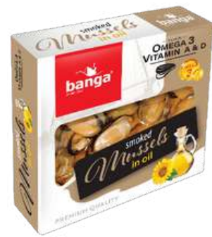
Primary package (Can Nr.21 + TR lid)