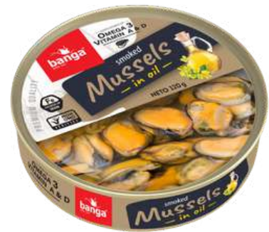
Primary package (Can Nr.21 + TR lid)