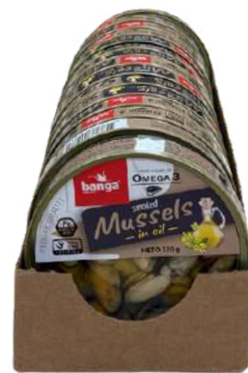
Secondary package (Display box)