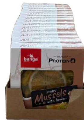
Secondary package (Display box)