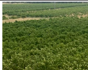
RiverBank Estate Vineyards