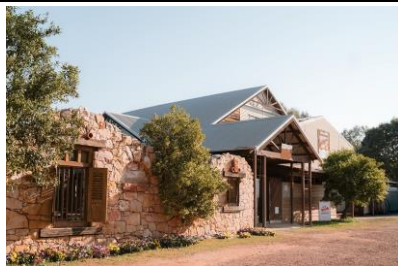
RiverBank Estate Cellar Door & Winery